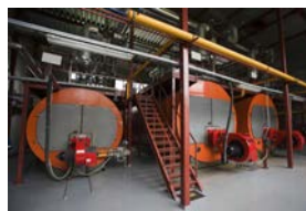
Boilers & Process Heat