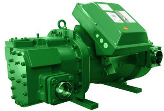
BITZER SEMI-HERMETIC EXPANDER/GENERATOR