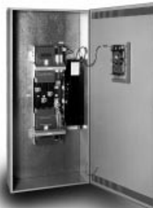
TS 840 - 600 AMP TRANSFER SWITCH