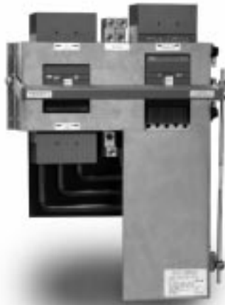
TS 840 - 250 AMP TRANSFER SWITCH